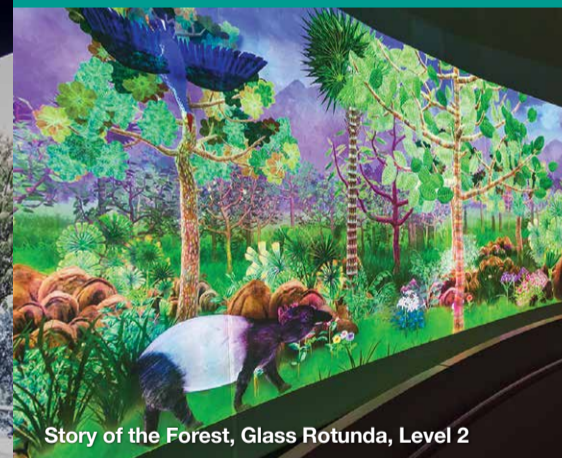
Story of the Forest, Glass Rotunda, Level 2