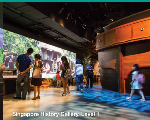
Singapore History Gallery, Level 1