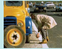
Film still of Traffic by Jacques Tati.