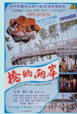
Two Sides of the Bridge movie poster.