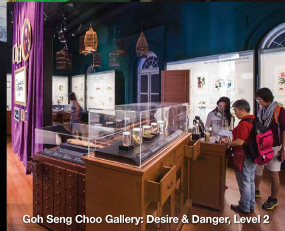
Goh Seng Choo Gallery: Desire & Danger, Level 2